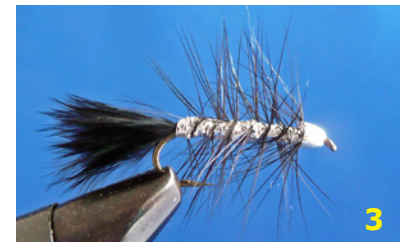
The Finished Fly