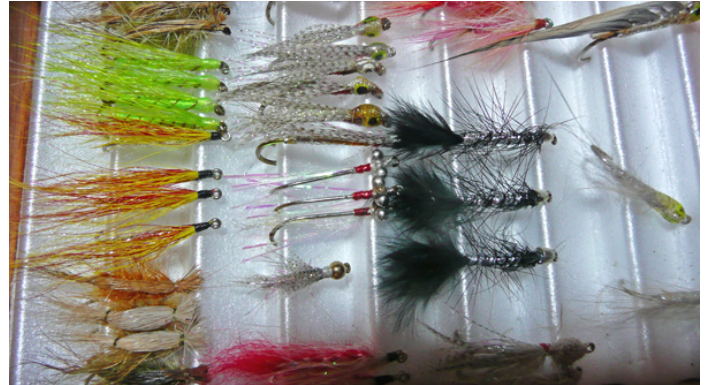
Peter Chatt's Cutthroat fly box.

It is in my flybox and has been used as a go to fly even before the fry come out.