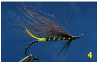
Black Bear Green Butt