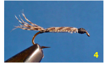
The Finished Fly