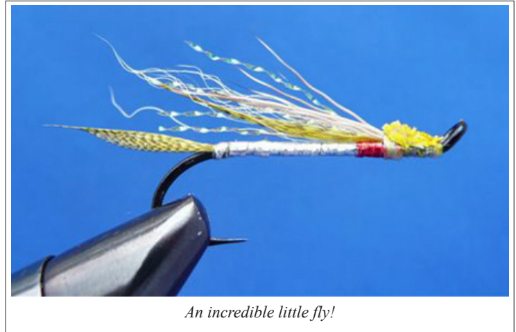
An incredible little fly!

While sitting on a log, I contemplated my weapon of choice. A "KCK"? Hmmmmm... No... The ones I had were too heavily weighted for the water before me. An "UGT" seemed appropriate but my box held only one. One which I wanted to save for another spot should fishing be unproductive here.