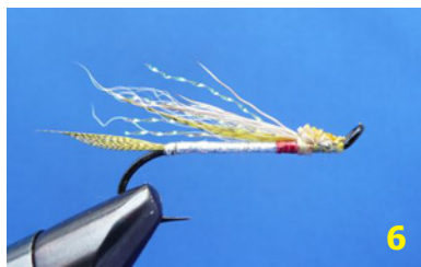
Lois' Golden Muddler

Clip the Deer hair to a short arrowhead shape.