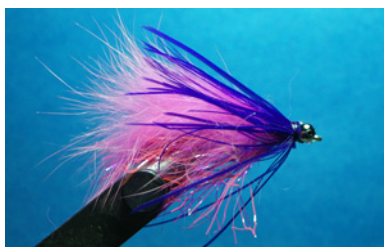
The Finished Fly