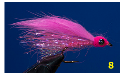
The Finished Fly